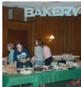
A delicious corner!