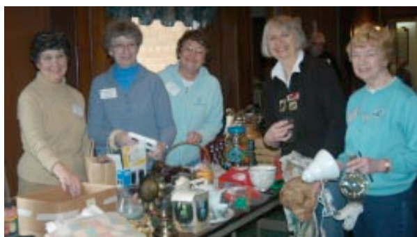
The Flea Market ladies always make attractive displays to bring in customers in search of a bargain on a "much-needed" treasure!