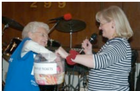
Picking the winning raffle tickets