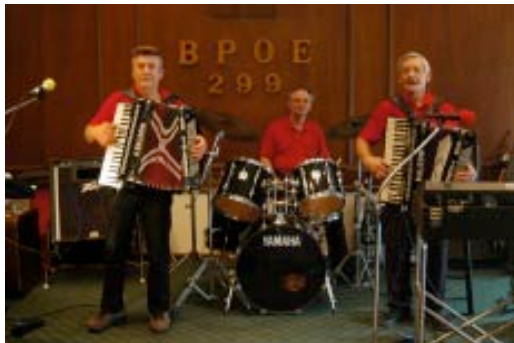
Zimmer Funeral Home donated half the cost of the popular German band.