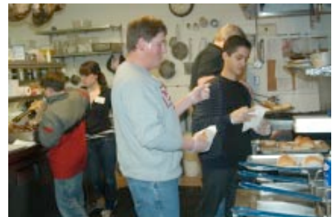
The kitchen crew worked hard all day.