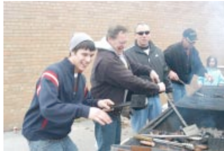
The fryers - hard work and lots of smoke!