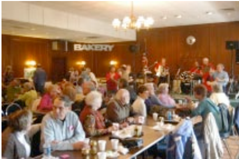
Brat Fry patrons enjoyed the food and the lively German music