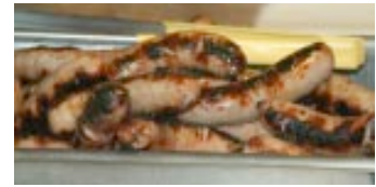
Delicious brats - mouthwatering!